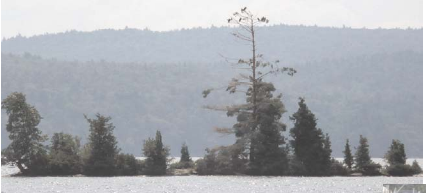
Top: The guano from the cormorants has already begun to kill vegetation on the island where they have been roosting. Right: Geese enjoying the turf grass at Veterans Park in Bolton Landing this summer.

DEC is aware of the cormorant population on Lake George and keeping a close eye on things. 12 cormorants were killed in August out of the estimated 40-60 found on the lake this year, which is up from about 20-25 birds observed in 2006. A nest was started on Three Sirens Island, but not completed, so there has been no evidence of breeding at Lake George.